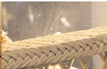
Sealed and Finished Weather-Resistant Weaves