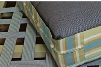
Patented Drain Through Upholstery System